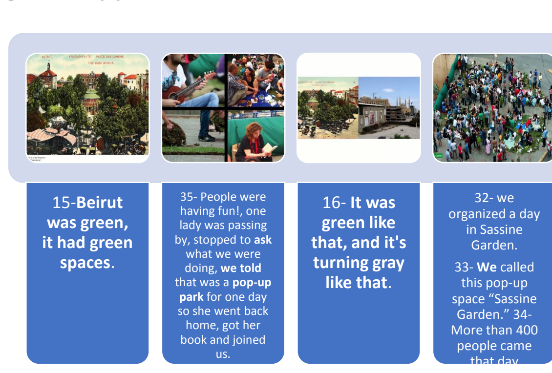
Figure 3. shows verbal and emotional evaluation.

story with the now gray story , she presented a photo combining the two states. On talking about the pop-up space Sassine, which was a one-day garden organized by the campaign, she presents photos to engage the audience with her.